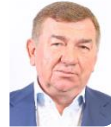
Alexander Polukeyev Vice-Governor in SPB from 2006 to 2009